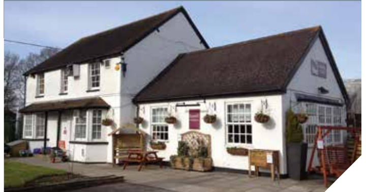
Squire's garden centre near London (UK)

A new entrance, a HighLight arched greenhouse and a venlo canopy will extent this garden centre with almost 1,700 m 2 extra space. It will give this garden centre a total metamorphose for the future.