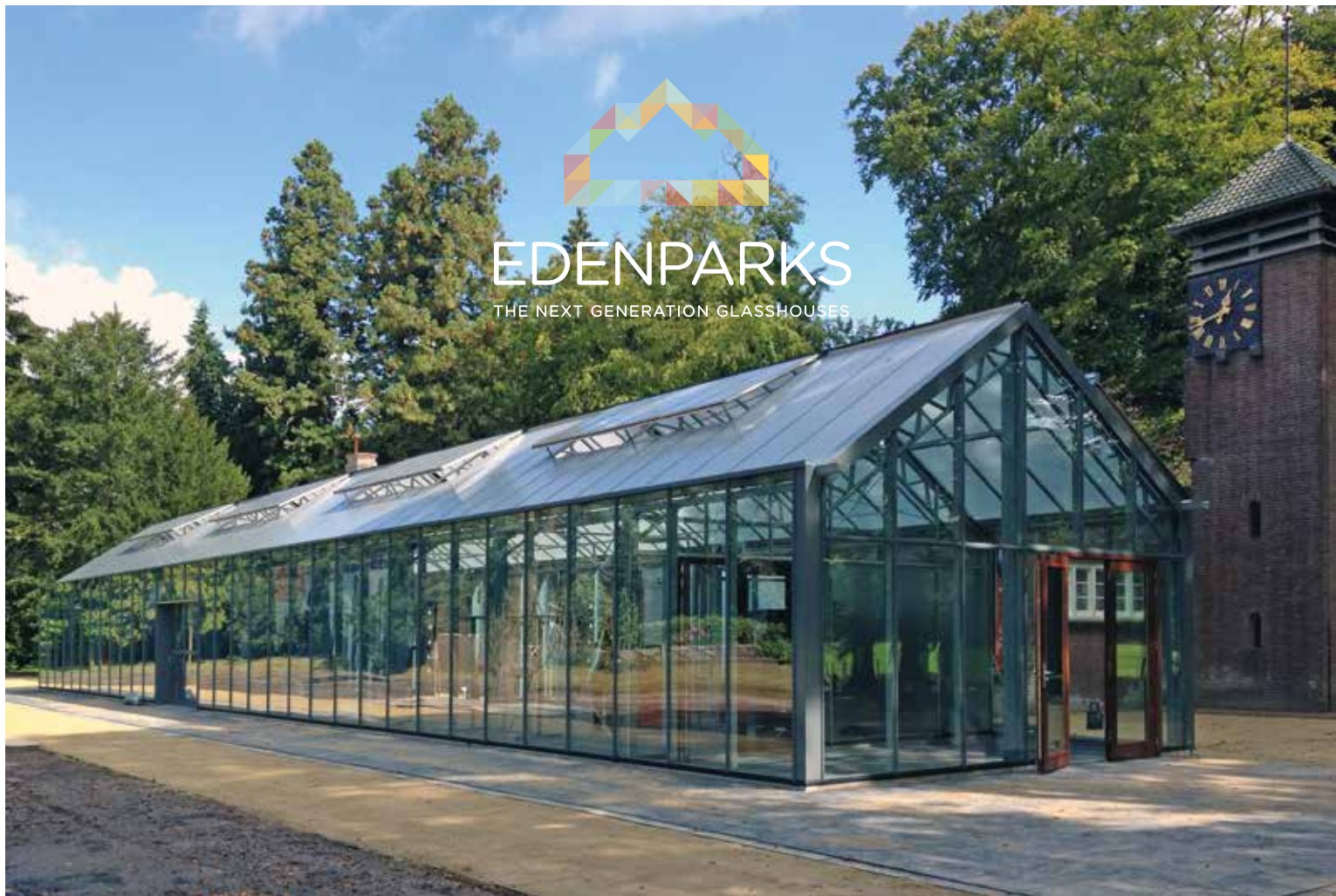
Huis Doorn | Kas aan garage